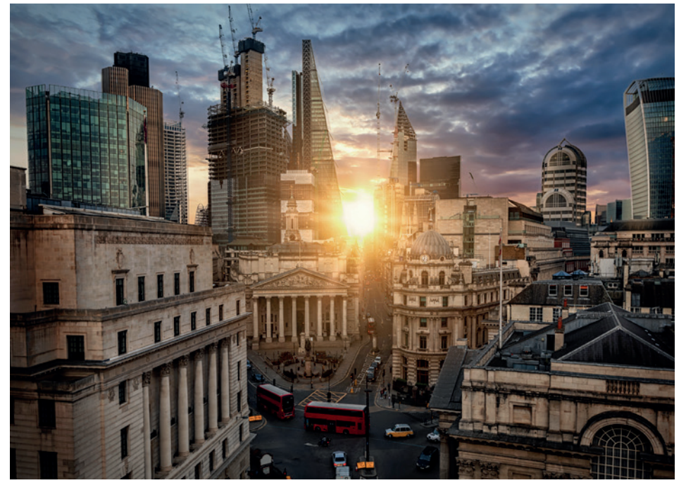
Written March 2020 and updated May 2022

Financial advice and regular reviews are essential to help position your portfolio in line with your objectives and attitude to risk, and to develop a well-defined investment plan, tailored to your objectives and risk profile.